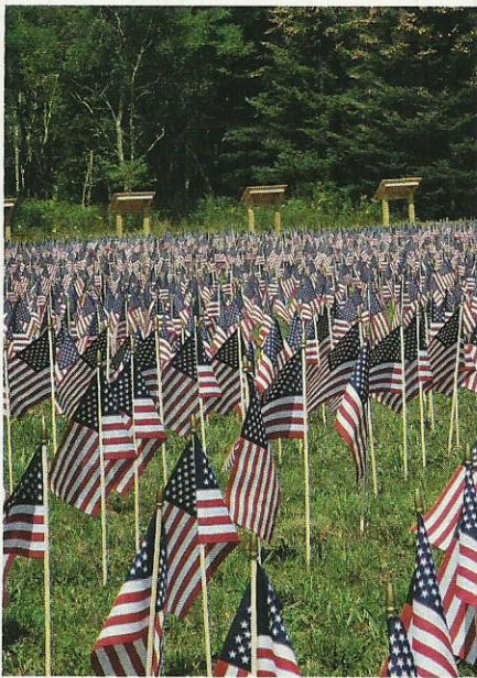
AMERICAN FLAGS: More than 7,000 American flags are on display to honor the American service men and women who died after the terrorist attacks on September 11, 2001.

Since the initial Sept. 11, 2001 attack, millions of Americans have served in the military in the effort to rid the world of terrorism. Thousands